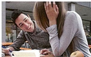
Learning in the library

Also, the university's sports facilities are available to participants free of charge. A diverse social program offers cultural and social events for every taste: concerts, movie nights, excursions and much more.