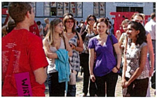
Meeting point University Square