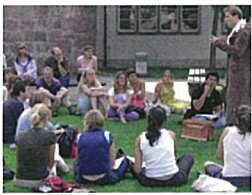
Seminar in one of the University's historic patios